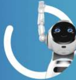
APHEL Serving hospitals: