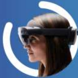
OPTIP Close, at a distance