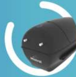
MISTRAL Diagnosis in a breath, health in a blow