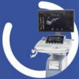
HEALTHCARE GE solutions and advanced technologies